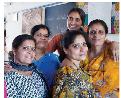
WOMEN ENTREPRENEURS IN INDIA