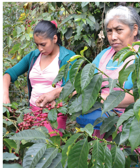
GUATEMALA: WOMEN COFFEE GROWERS

The project is providing coffee farmers with the specialized knowledge they need to combat coffee