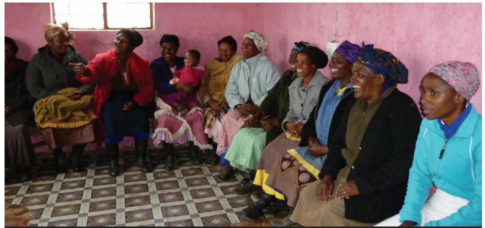
WOMEN FARMERS PARTICIPATING IN TRAINING, SOUTH AFRICA.