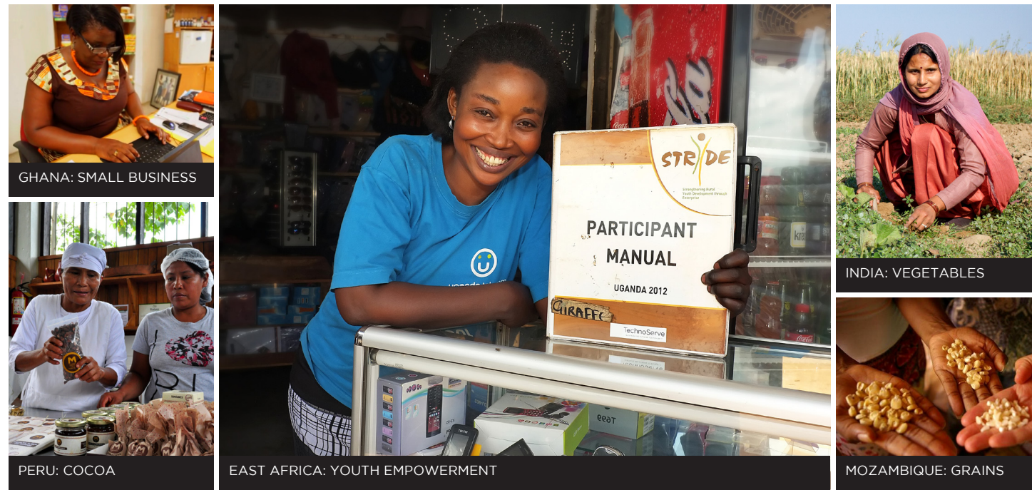
GHANA: SMALL BUSINESS