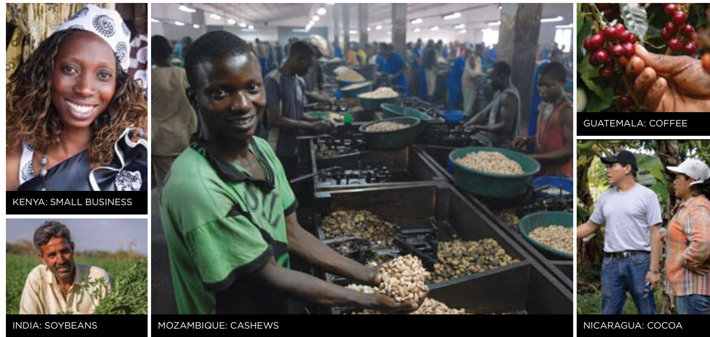
KENYA: SMALL BUSINESS